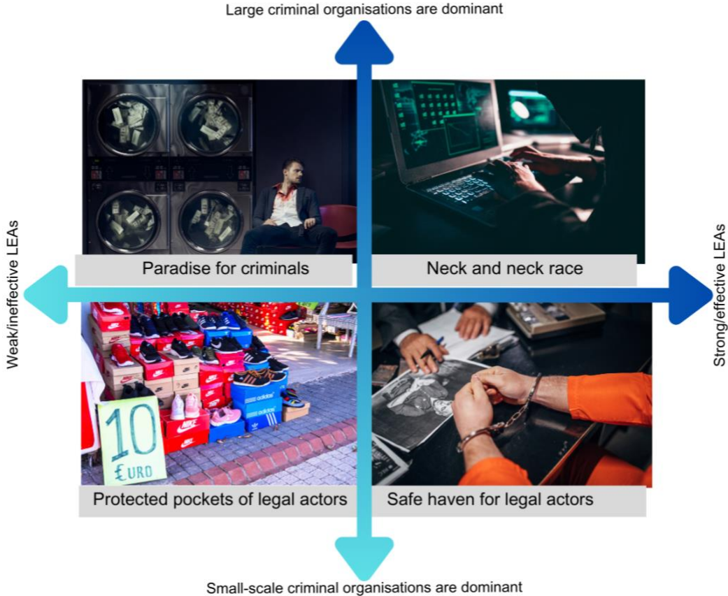
Figure 1: Four scenarios